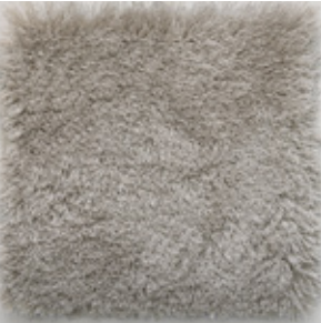
RIPE - HIGH PILE pure mohair weight 4800 gr/m² height 40 mm

RIPE - a refined pure mohair quality with the softest feel