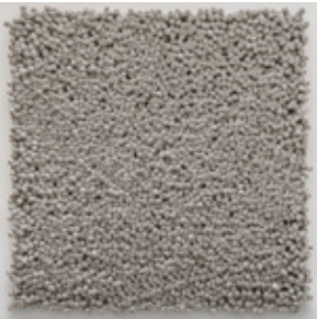
BASALT - LOW PILE pure new felted wool weight 4100 gr/m² height 25 mm