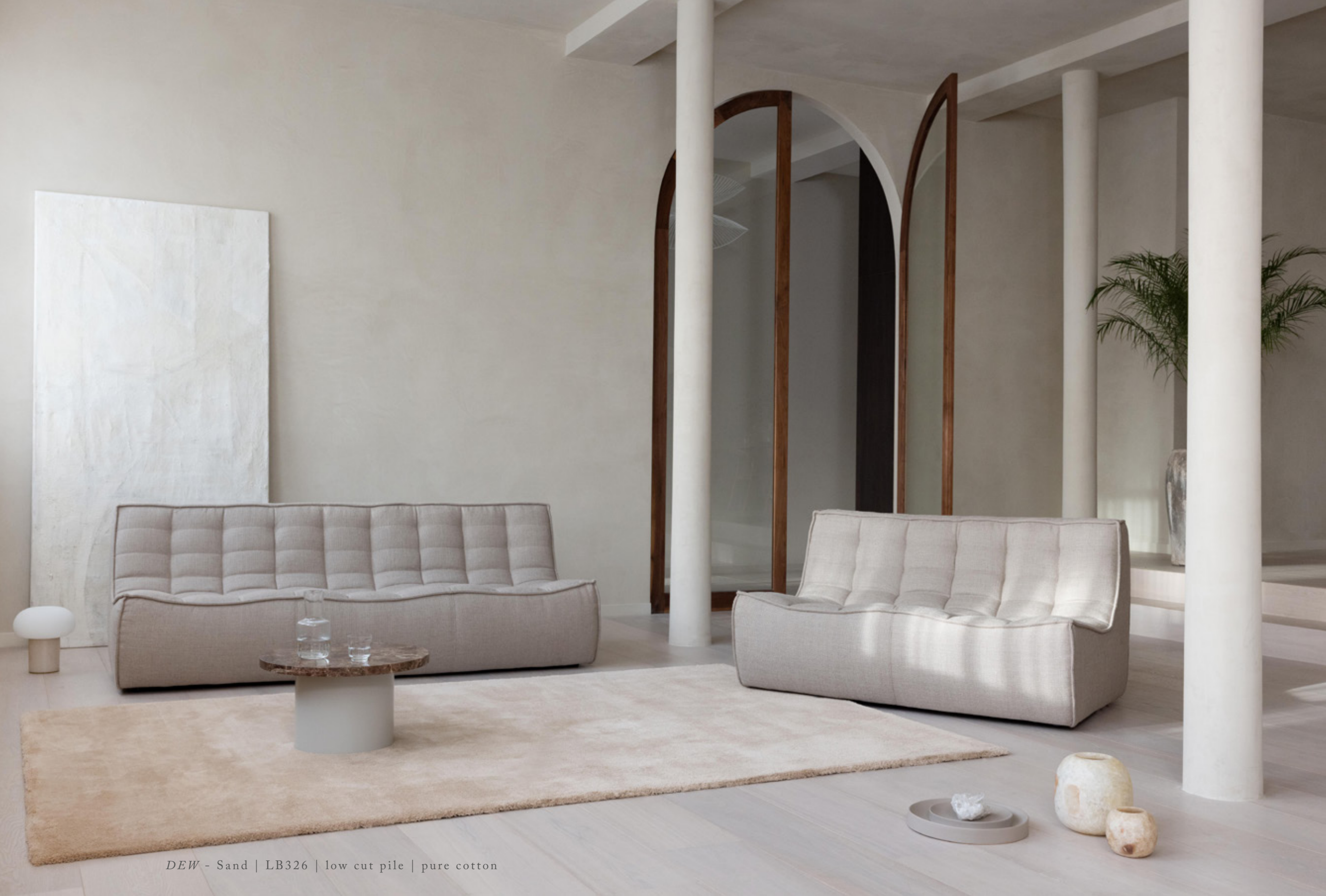
DEW - Sand | LB326 | low cut pile | pure cotton