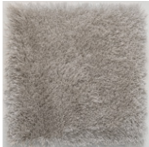
FLARE - HIGH PILE pure new wool weight 4800 gr/m² height 40 mm

FLARE - a delicate combed woolen yarn with a soft sheen