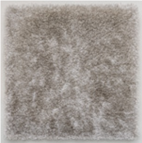
LISCIO - LOW PILE pure eucalyptus weight 5800 gr/m² height 20 mm

LISCIO - shiny and strong, made of eucalyptus fibre (Tencel™)