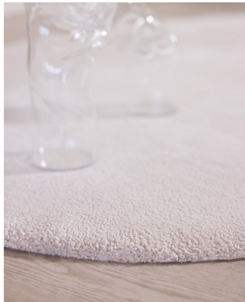
DEW - Shell | LB325 | low cut pile | pure cotton