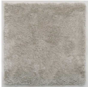
DEW - LOW PILE pure cotton weight 5300 gr/m² height 20 mm

DEW - a mercerised cotton quality with a cool and soft touch