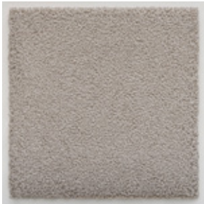
FLARE - LOOP PILE pure new wool weight 4400 gr/m² height 20 mm

DEW - a mercerised cotton quality with a cool and soft touch