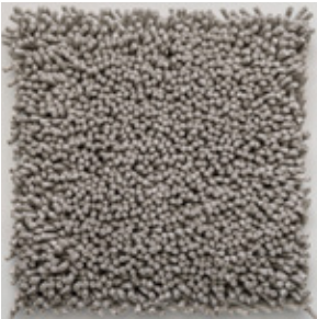
BASALT - HIGH PILE pure new felted wool weight 4300 gr/m² height 30 mm

BASALT - thick felted wool piles make a sensational surface