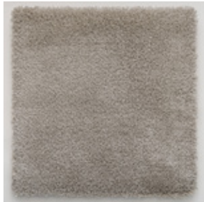
FLARE - LOW PILE pure new wool weight 4400 gr/m² height 20 mm