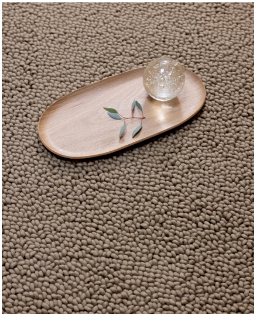
BASALT - Clay | LB319 | loop pile | felted wool