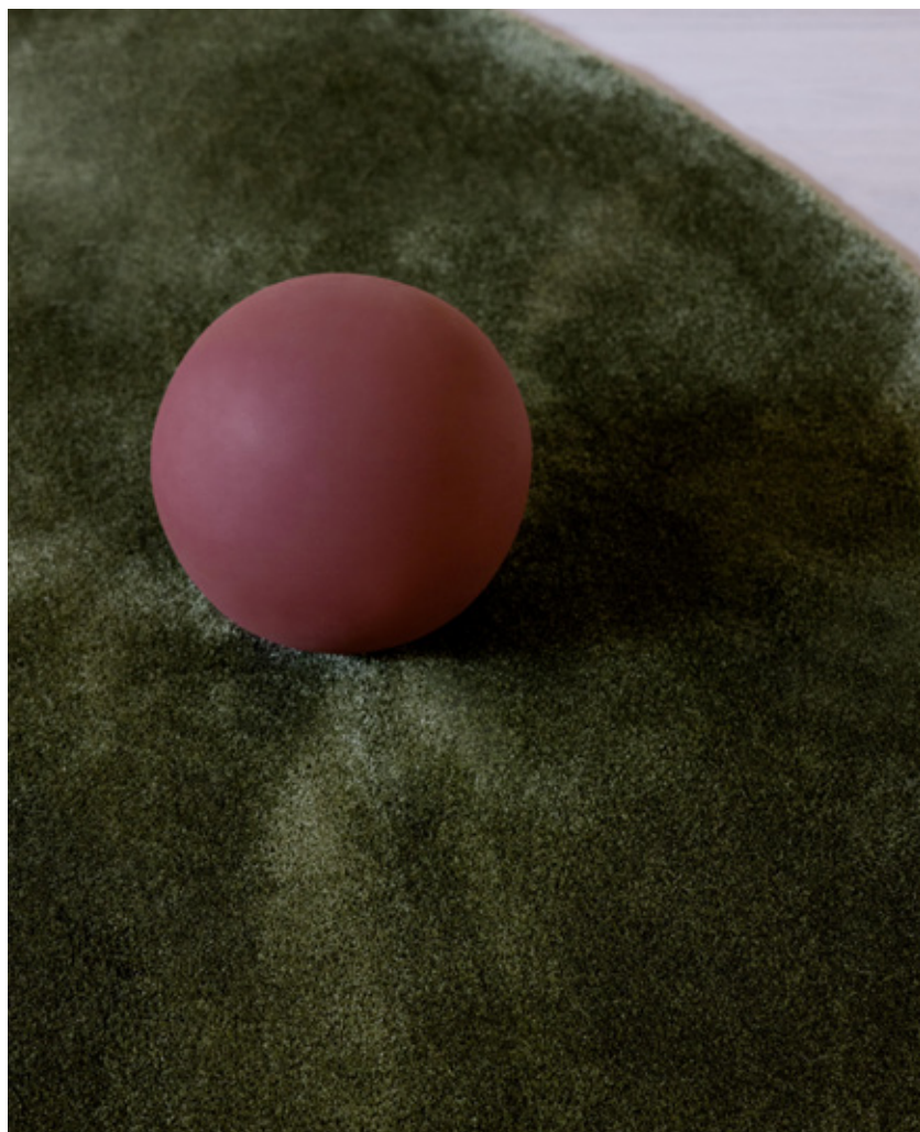
LISCIO - Moss | LB317 | low cut pile | eucalyptus, Tencel™